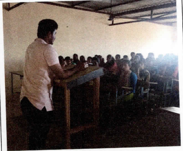
Votes of Thanks – Participants, 01/02/2020